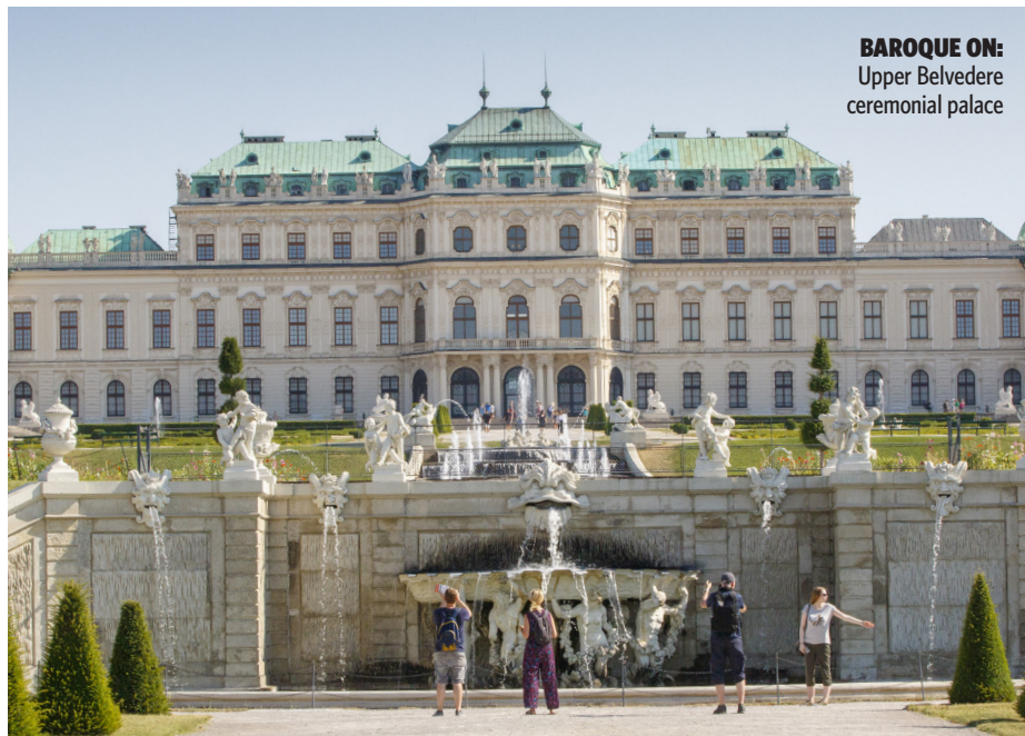
BAROQUE ON: Upper Belvedere ceremonial palace

The Halloween midterm package is available from October 21 to November 3, and includes one night with breakfast for two adults and up to four children, Halloween treats and a welcome 'spooky' cocktail, priced from €450.